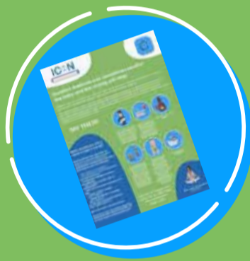
Barr RG. The normal crying curve: what do we really know? Developmental Medicine and Child Neurology 1990;32(4):356-362.

Even though it is normal for babies to cry more from about 2 weeks, it is still important to check a few basic needs. Check they aren't poorly and try some comforting methods (see C is for Comforting for more ideas about how to soothe your baby). Babies that are born prematurely start to cry more about 2 weeks after the date when they were due to be born.